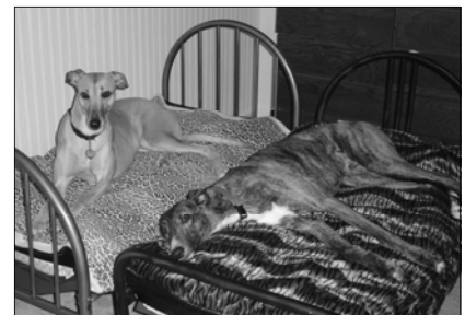
Gracie & Hobbes enjoying the good life!