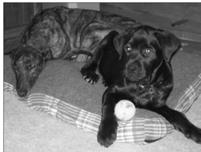
Caliph and his Christmas present.