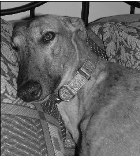
Chaz lounging at home.